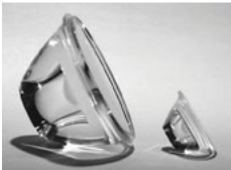
Figure 1: Gaggione's 32 mm and 67 mm diameter LEDnLIGHT® collimators made of DOWSIL™ MS-1002 Moldable Silicone

One of the key challenges Gaggione confronted was that its collimator design incorporated a negative draft angle as well as variable wall thicknesses. Both of these features are difficult to fabricate using conventional thermoplastics or glass. In addition, targeted LED lighting applications demanded that the material deliver reliable mechanical and optical performance despite exposure to high lumen densities, outdoor ultraviolet (UV) light, external temperatures cycling between -40°C and 125°C, and internal module temperatures reaching as high as 110°C.